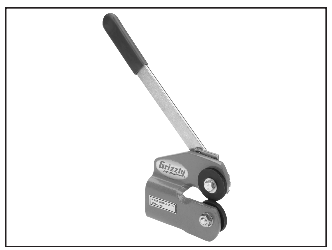
Figure 1. Model G9947

If you need help with your new tool, call our Tech Support at: (570) 546-9663.